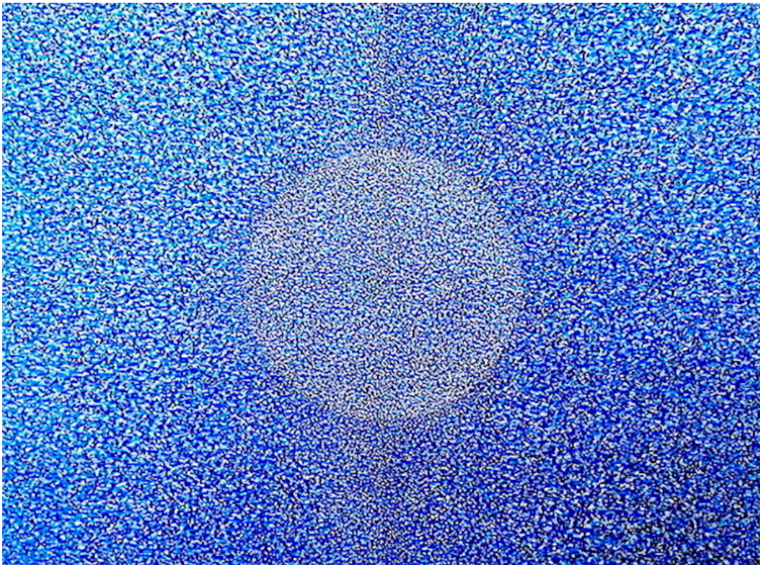
Transcending the Blues, acrylic on panel, 18" x 24"

ALL RIGHTS RESERVED. DO NOT REPRODUCE IMAGES WITHOUT THE ARTIST'S PERMISSION.