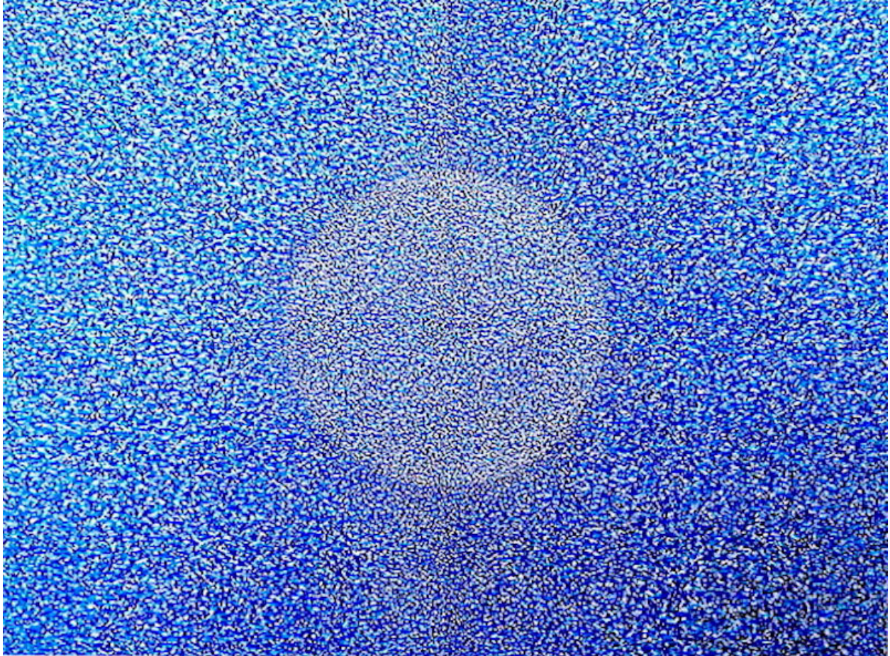
Transcending The Blues, acrylic on panel, 18" x 24"

“I began work on Enchantment when I was living in Santa Fe, NM. It was the last painting I worked on before moving to CT. My paintings reveal themselves to me over time. Enchantment was one of those paintings that I had to set aside, from time to time, so that I could give it time to let me know what it required of me. That relatively long gestation period was worth it. I love this painting!”